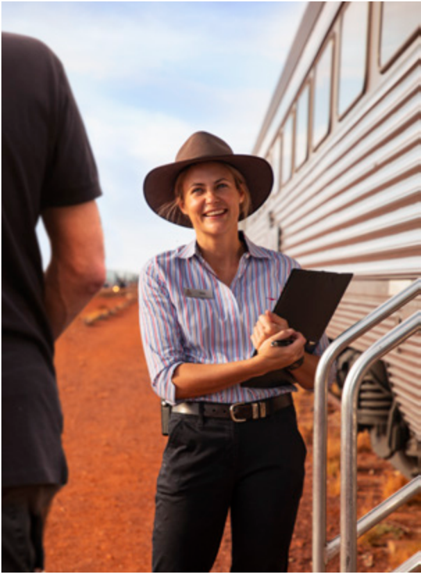
GOLD SERVICE HOSPITALITY ATTENDANT