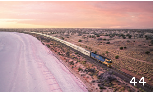
Indian Pacific Journeys