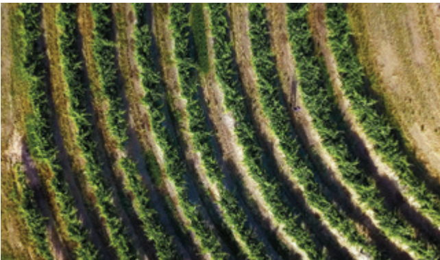
BAROSSA VALLEY, SA