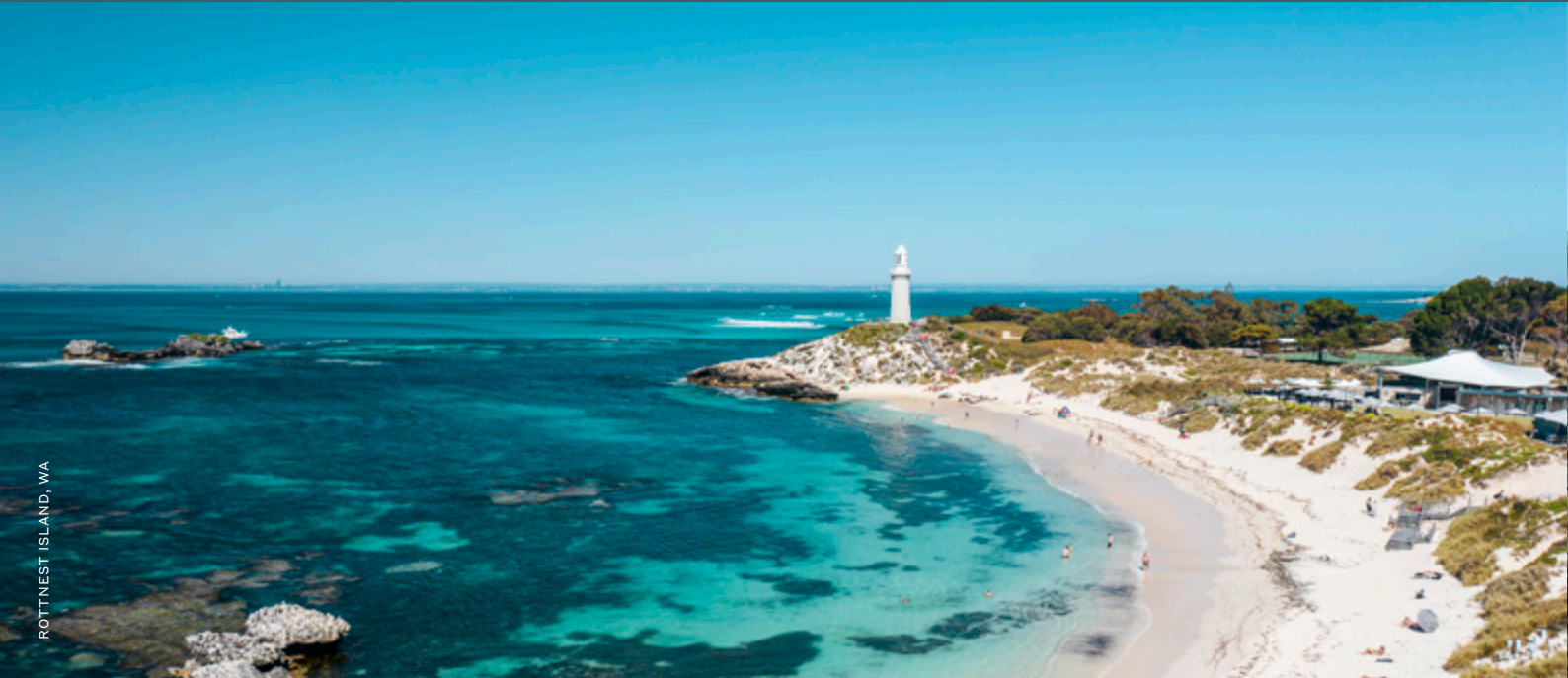
ROTTNEST ISLAND, WA