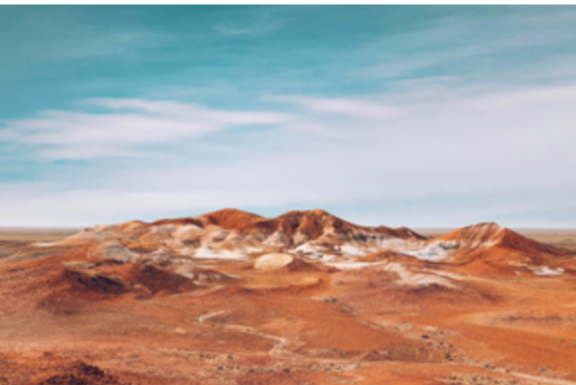
COOBER PEDY, SA