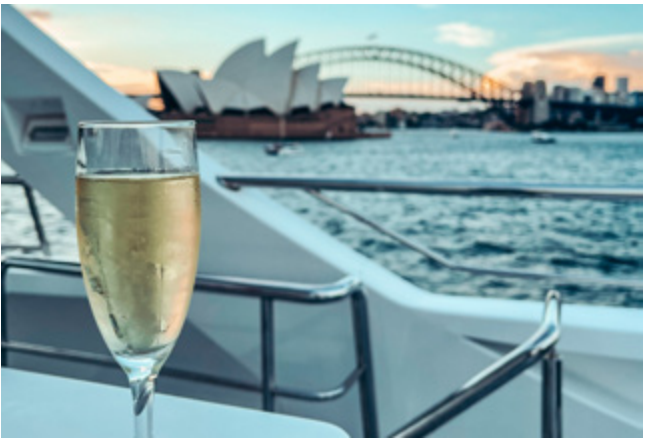
SYDNEY HARBOUR, NSW