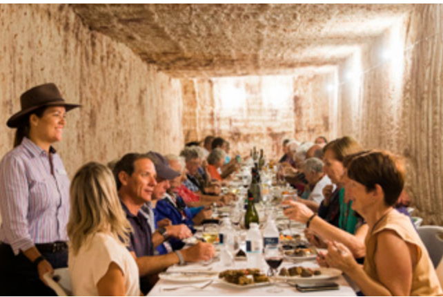
COOBER PEDY, SA