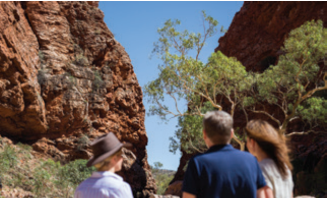
SIMPSONS GAP, NT