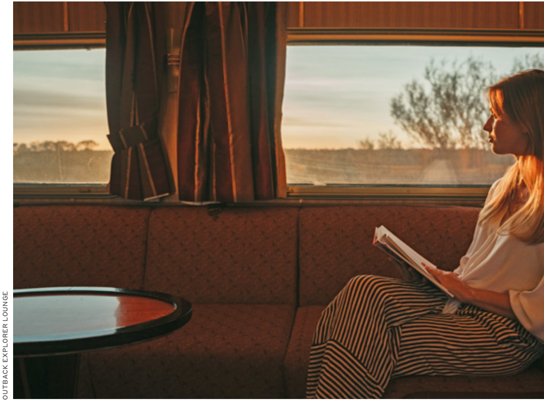
OUTBACK EXPLORER LOUNGE

Choose between Gold Service Twin and Single Cabins, both of which provide the perfect place to relax and recharge after a day of Off Train Experiences. Spend hours deep in conversation with new friends in the shared Outback Explorer Lounge, then make your way to the Queen Adelaide Restaurant for dining. Gold Service fares include hearty breakfasts, two-course lunches and three-course dinners. You may also choose to complement your meal with our selection of premium wines and beverages, which are also included in your fare.