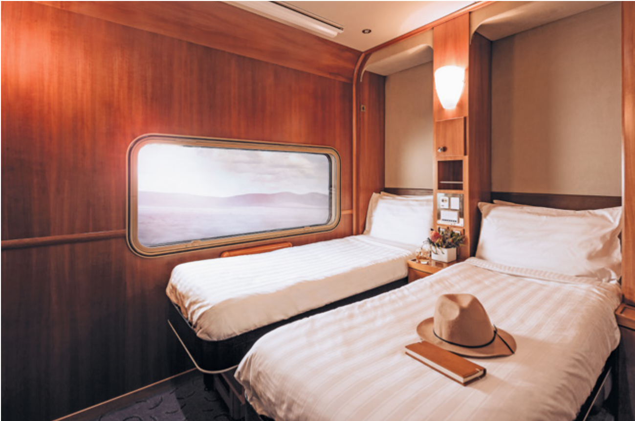
PLATINUM SERVICE TWIN CABIN BY NIGHT