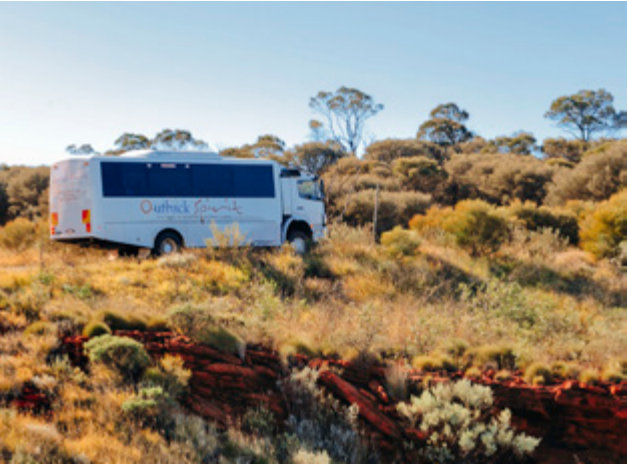
OUTBACK SPIRIT EXPERIENCE, NT

Experience the wonders of the majestic Kings Canyon with your choice of walk, including the 6 km rim walk featuring breathtaking views of the Watarrka National Park or a less arduous 2.6 km walk along the canyon floor. (B,L,D)