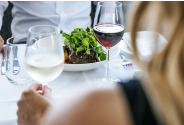
SYDNEY HARBOUR, NSW

On our lunch cruise we treat you to a delicious two course menu, including a decadent dessert. If you're joining us on our dinner cruise, you'll enjoy a multi course chef-designed menu featuring the best of New South Wales' ingredients, showcasing the multicultural influences of the Sydney dining scene. Pair both of these cruise menus with wines from some of New South Wales' most prestigious wine regions and you've got the perfect culinary experience. If you want to experience the iconic Sydney Harbour in true style and elegance, this is the cruise for you. We concentrate on the little things, and that's what makes a big difference. Tours depart Tuesday to Sunday from King Street Wharf No. 8.