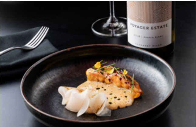
EUREKA 89, MELBOURNE, VIC