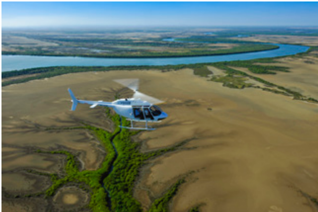
RINYIRRU (LAKEFIELD) NATIONAL PARK, NT

*Conditions apply. From price available for bookings made on or before 30 July 2021 unless allocation sold out prior. Valid for travel in 2022. Discounts vary between tours and between months of travel. Visit outbackspirittours.com.au for more details.