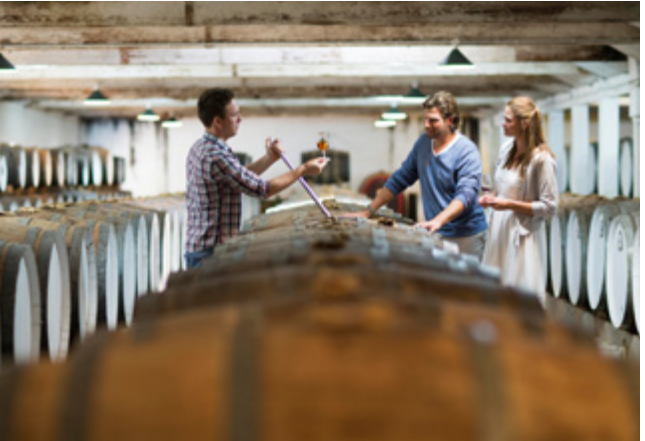
BAROSSA VALLEY, SA

After breakfast, check out of your accommodation. (B)