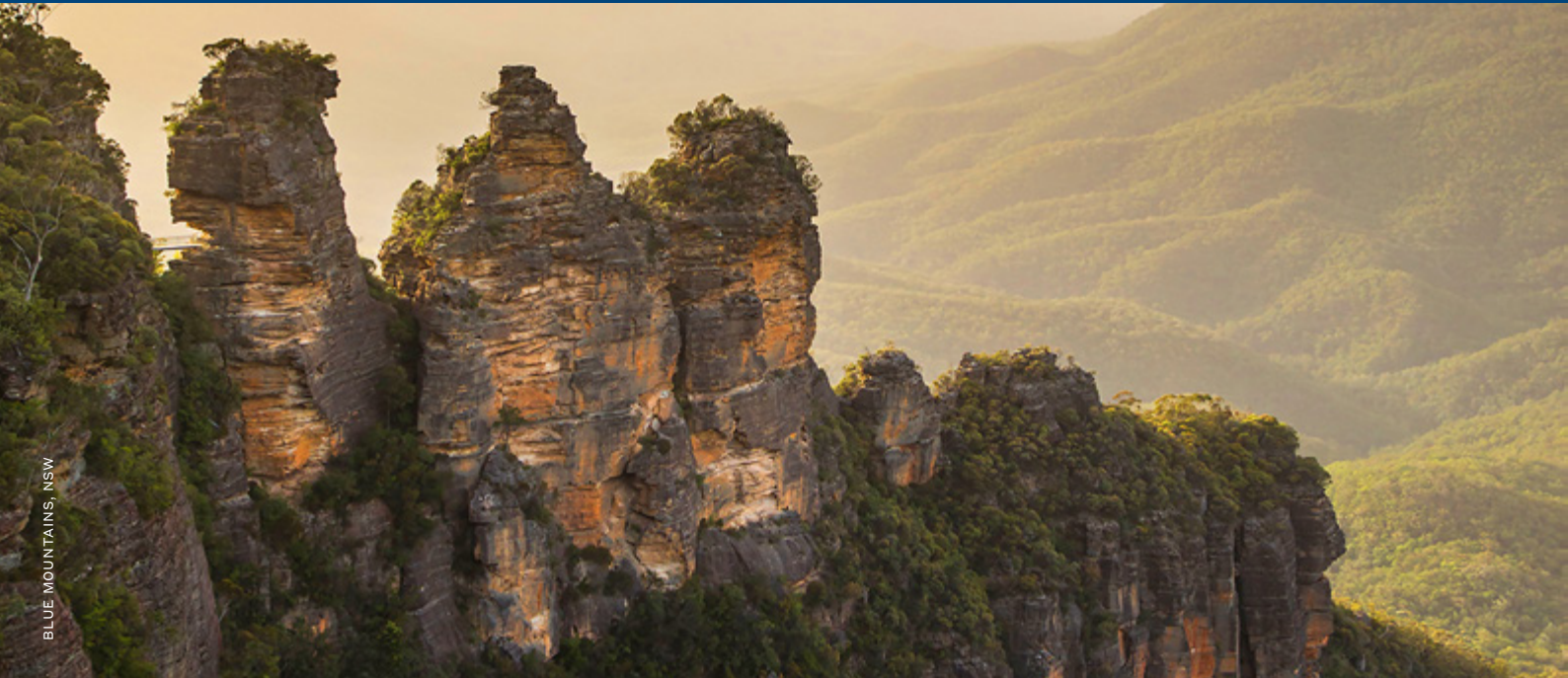
BLUE MOUNTAINS, NSW