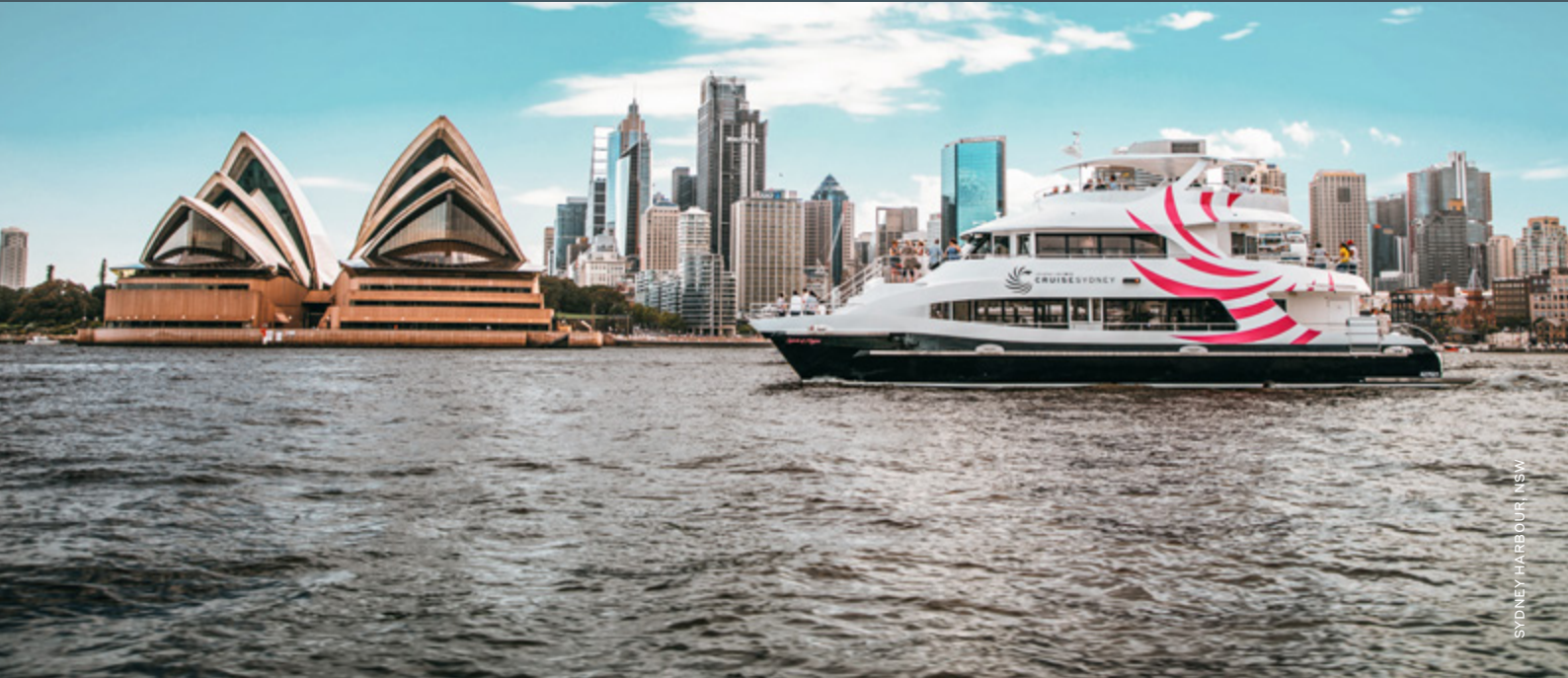
SYDNEY HARBOUR, NSW