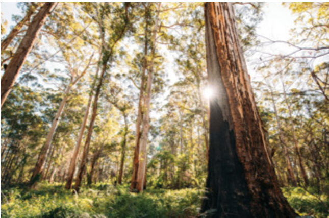
BORANUP FOREST, WA

Sydney to Perth (9 Days, 8 Nights) Adelaide to Perth (8 Days, 7 Nights) Perth to Adelaide (8 Days, 7 Nighths)