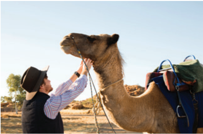
ALICE SPRINGS, NT

This morning you'll be greeted by a view of the spectacular Red Centre. A full day of experiences awaits you in the iconic outback town of Alice Springs. An optional upgrade is a scenic flight to Uluru, returning in time to meet the rest of your fellow guests at a spectacular dinner under the stars.