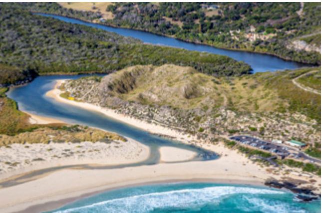
MARGARET RIVER, WA

Today board the Rottnest Express to unique, diverse Rottnest Island, 22km offshore. A 90-minute air-conditioned coach tour around 'Rotto' takes you to some spectacular locations, including Wadjemup Lighthouse and the boardwalk lookout at the rugged West End. Enjoy a delicious lunch before exploring the island at your leisure (make sure you see a quokka). Return to Perth by ferry in the afternoon. (B,L)