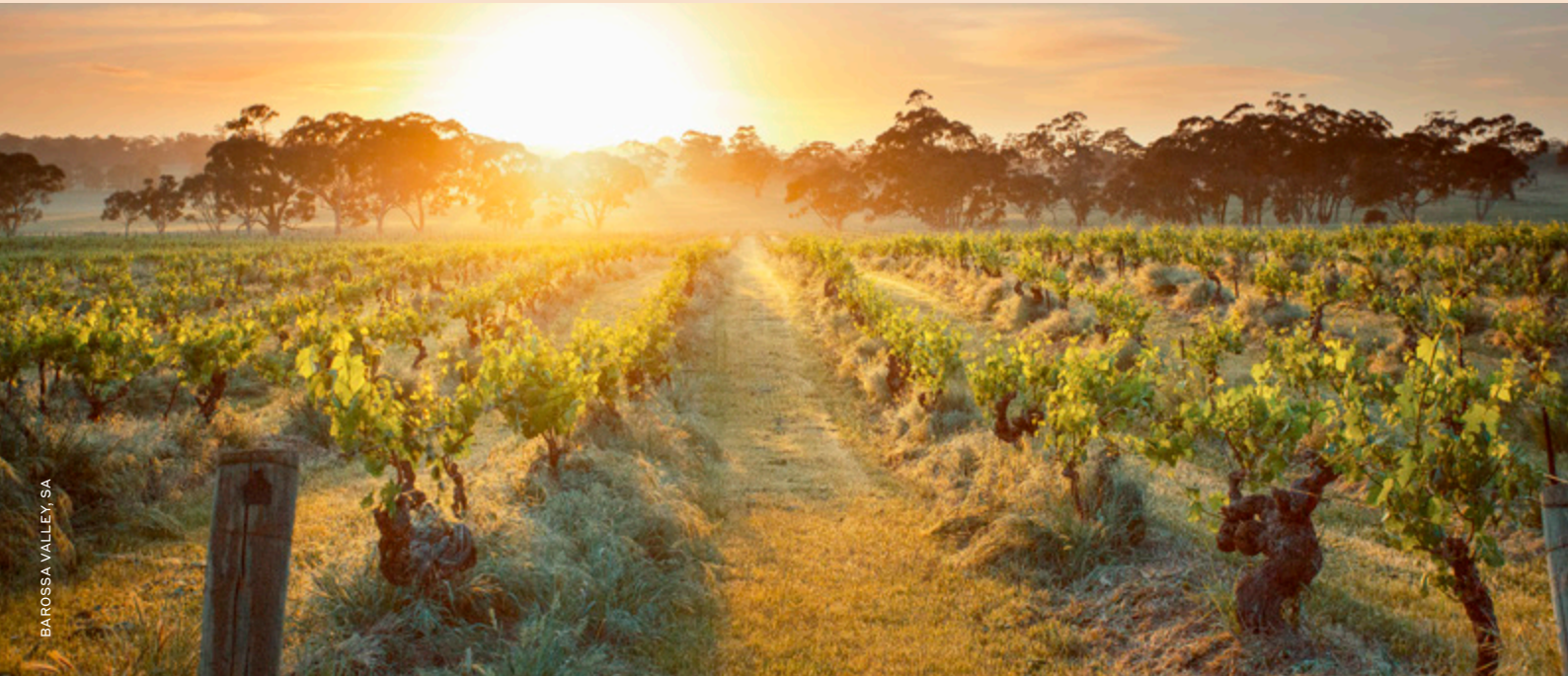
BAROSSA VALLEY, SA