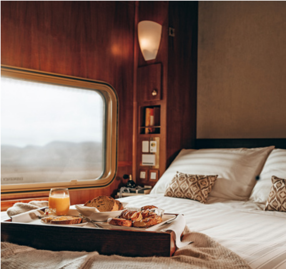
PLATINUM SERVICE DOUBLE CABIN BY MORNING