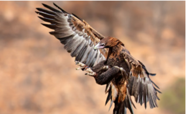
ALICE SPRINGS, NT