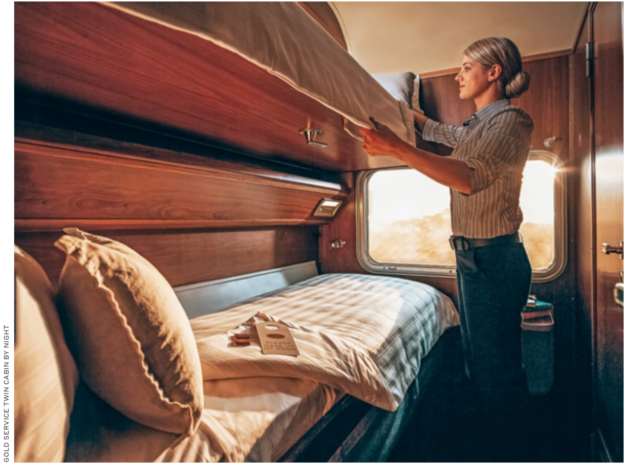
GOLD SERVICE TWIN CABIN BY NIGHT