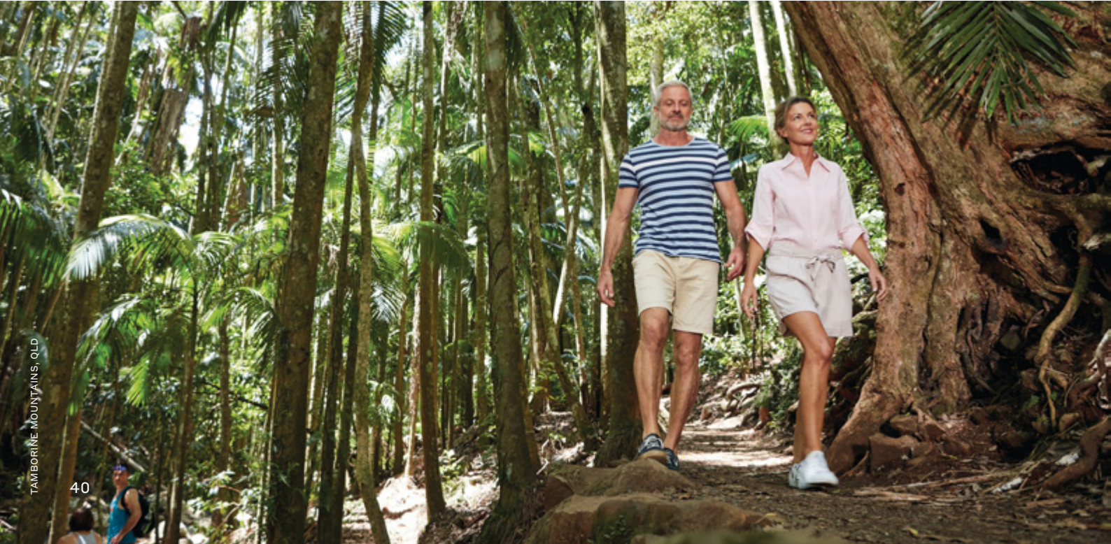
TAMBORINE MOUNTAINS, QLD