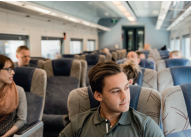
RED SERVICE, THE OVERLAND

Travel in Red Service on the Overland, settle into your comfortable reclining seat or make your way to the cafe 828 where meals and beverages are available to purchase.