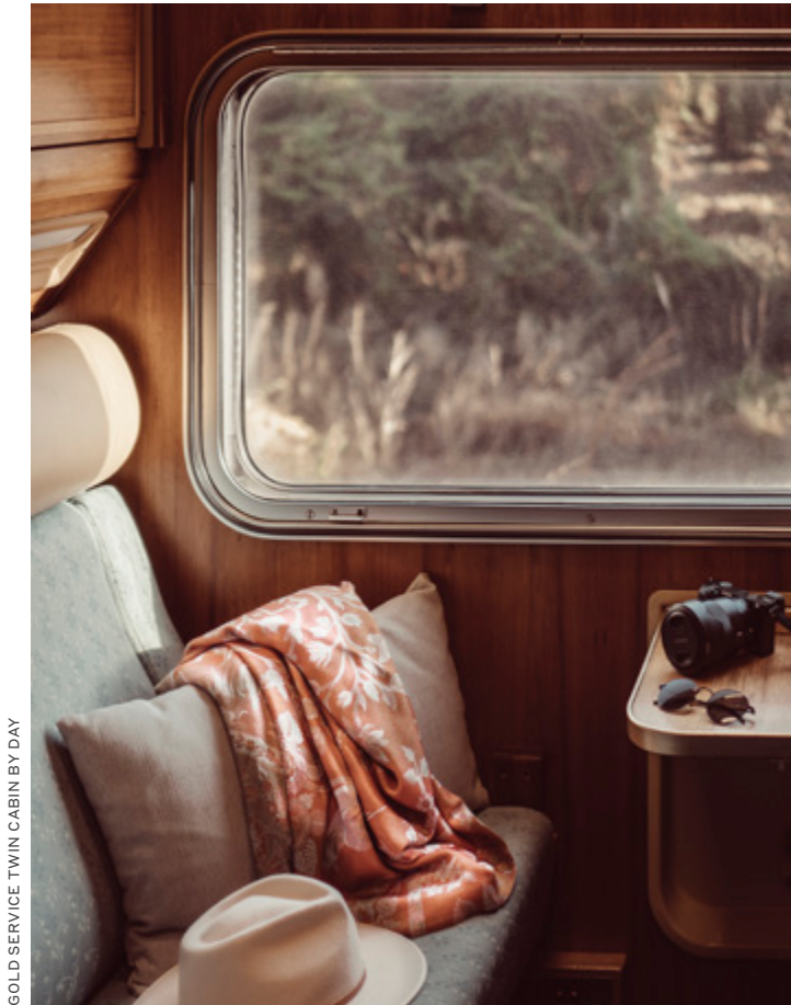
GOLD SERVICE TWIN CABIN BY DAY