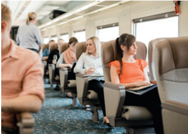
PREMIUM RED SERVICE, THE OVERLAND

Stops include Adelaide, Murray Bridge, Bordertown, Nhill, Dimboola, Horsham, Stawell, Ararat, Geelong and Melbourne.