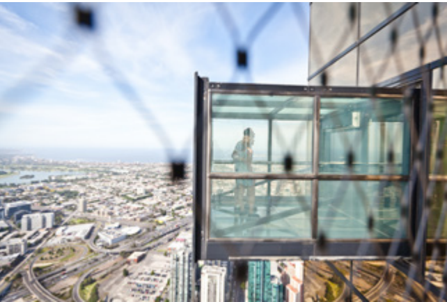
THE EDGE EXPERIENCE, MELBOURNE, VIC