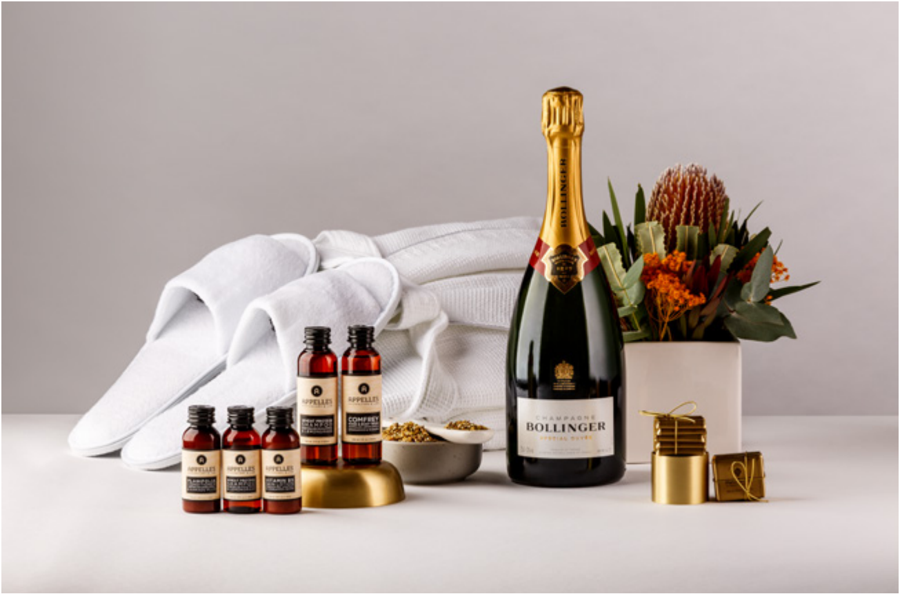
PLATINUM SERVICE AMENITIES