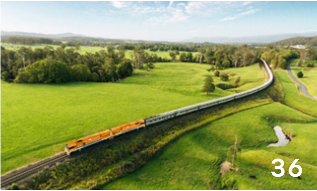
Great Southern Journeys