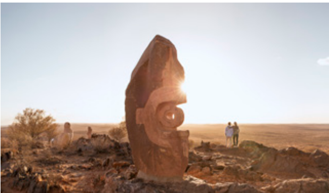
BROKEN HILL, NSW

Breakfast is served as you glide through the colourful patchwork of rolling hills of the Avon Valley on your way to Perth, arriving after an on board lunch.