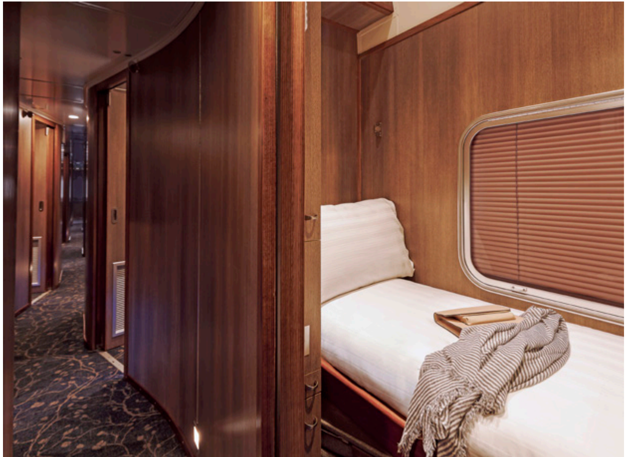
GOLD SERVICE SINGLE CABIN BY NIGHT