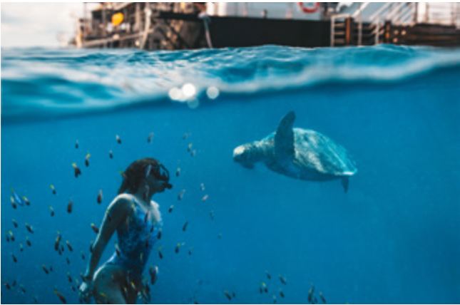
GREAT BARRIER REEF, QLD