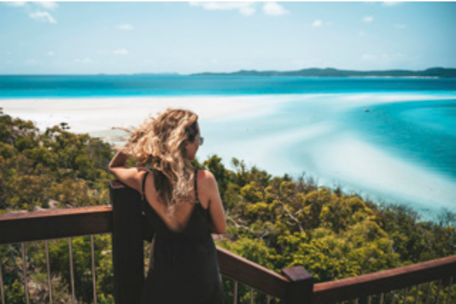
WHITEHAVEN BEACH, QLD