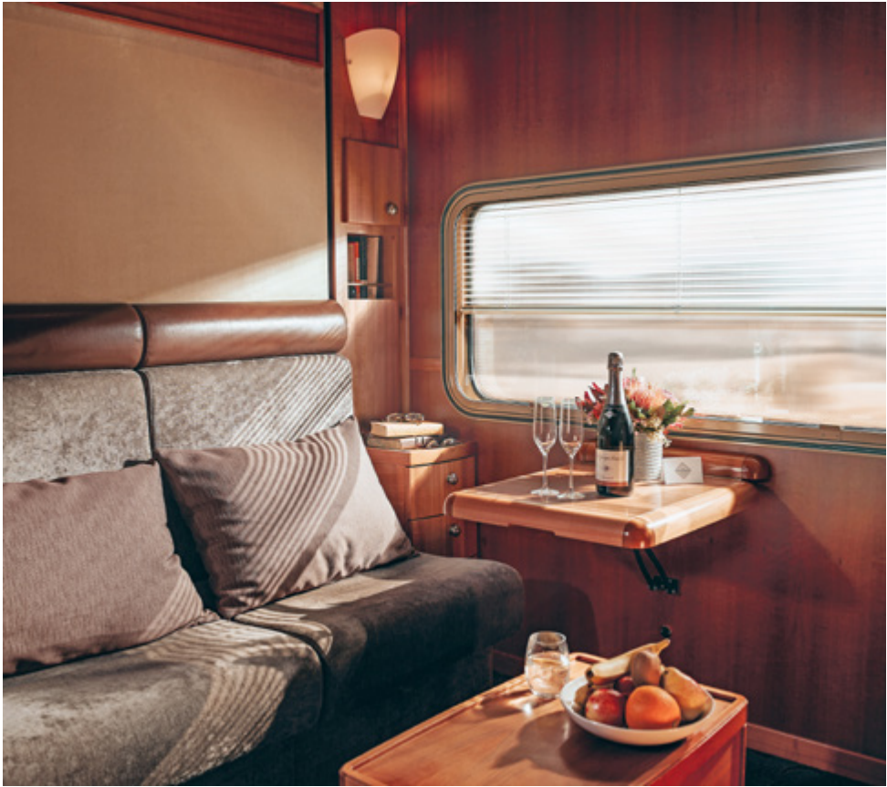
PLATINUM SERVICE DOUBLE CABIN BY DAY

It's the perfect place to relax and take in the amazing views sweeping past your panoramic windows. Or for a more social experience, head to the beautifully appointed Platinum Club, exclusive to Platinum guests. With a deluxe bar, lounge and fully flexible dining area, the Platinum Club sets the scene for relaxed daytime conversation or elegant dinner with friends.