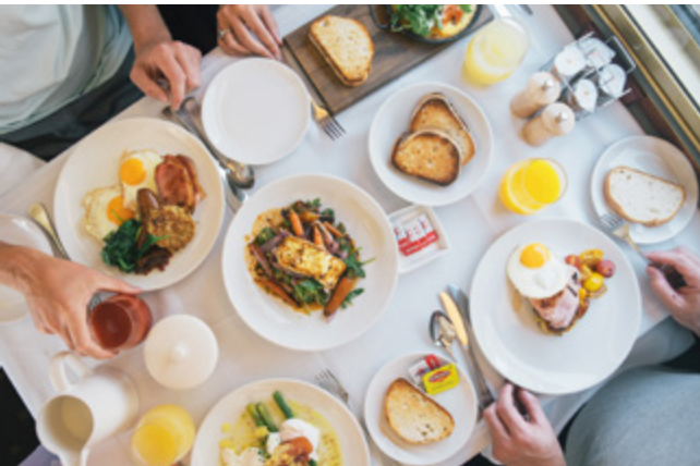
QUEEN ADELAIDE RESTAURANT