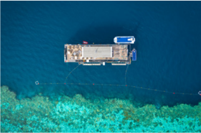
GREAT BARRIER REEF, QLD