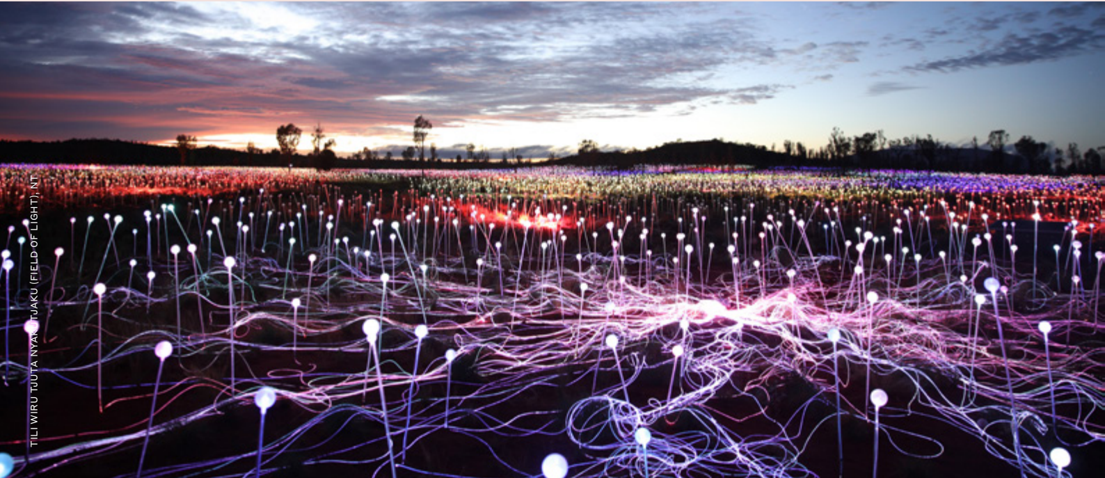
TILWIJU Tjuta Nya Tjaku (Field of Light), NT