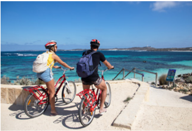
ROTTNEST ISLAND, WA

*Terms & conditions apply, visit rotnnestexpress.com.au for details.