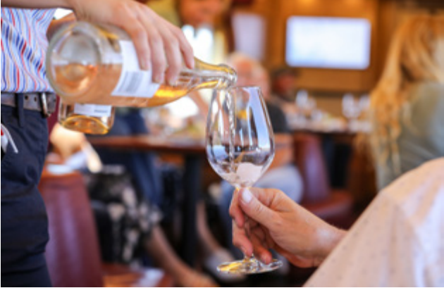
ABOARD THE GHAN