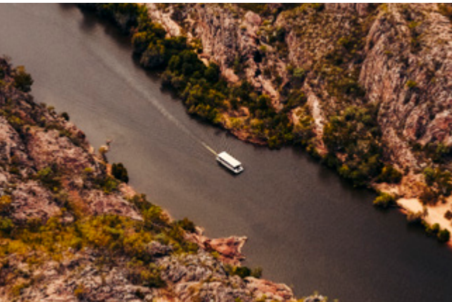
NITMILUK (KATHERINE), NT

For more information please visit journeybeyondrail.com.au