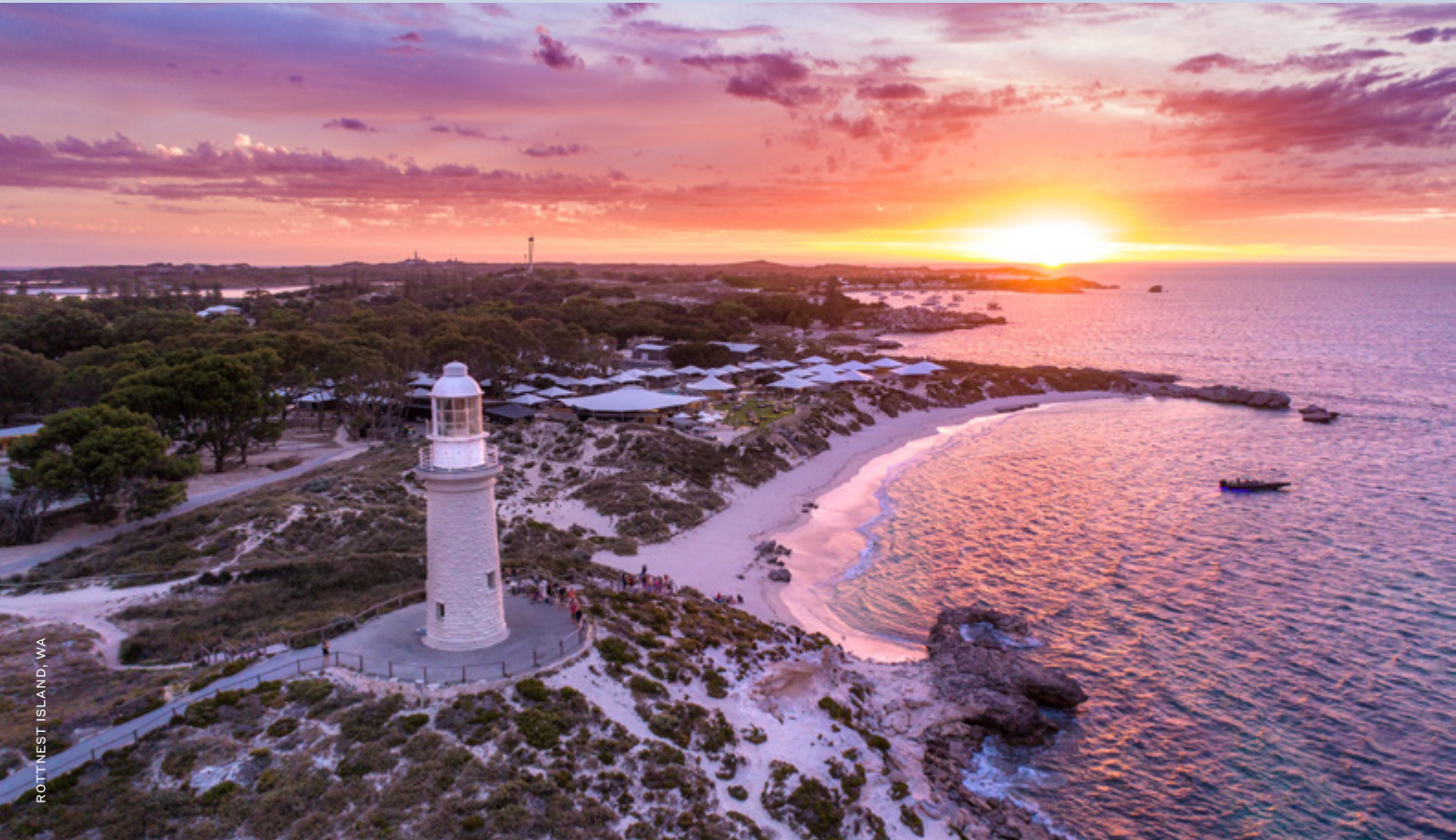
ROTTNEST ISLAND, WA

INDIAN PACIFIC | SYDNEY TO PERTH DEPARTING WEDNESDAY (YEAR ROUND)