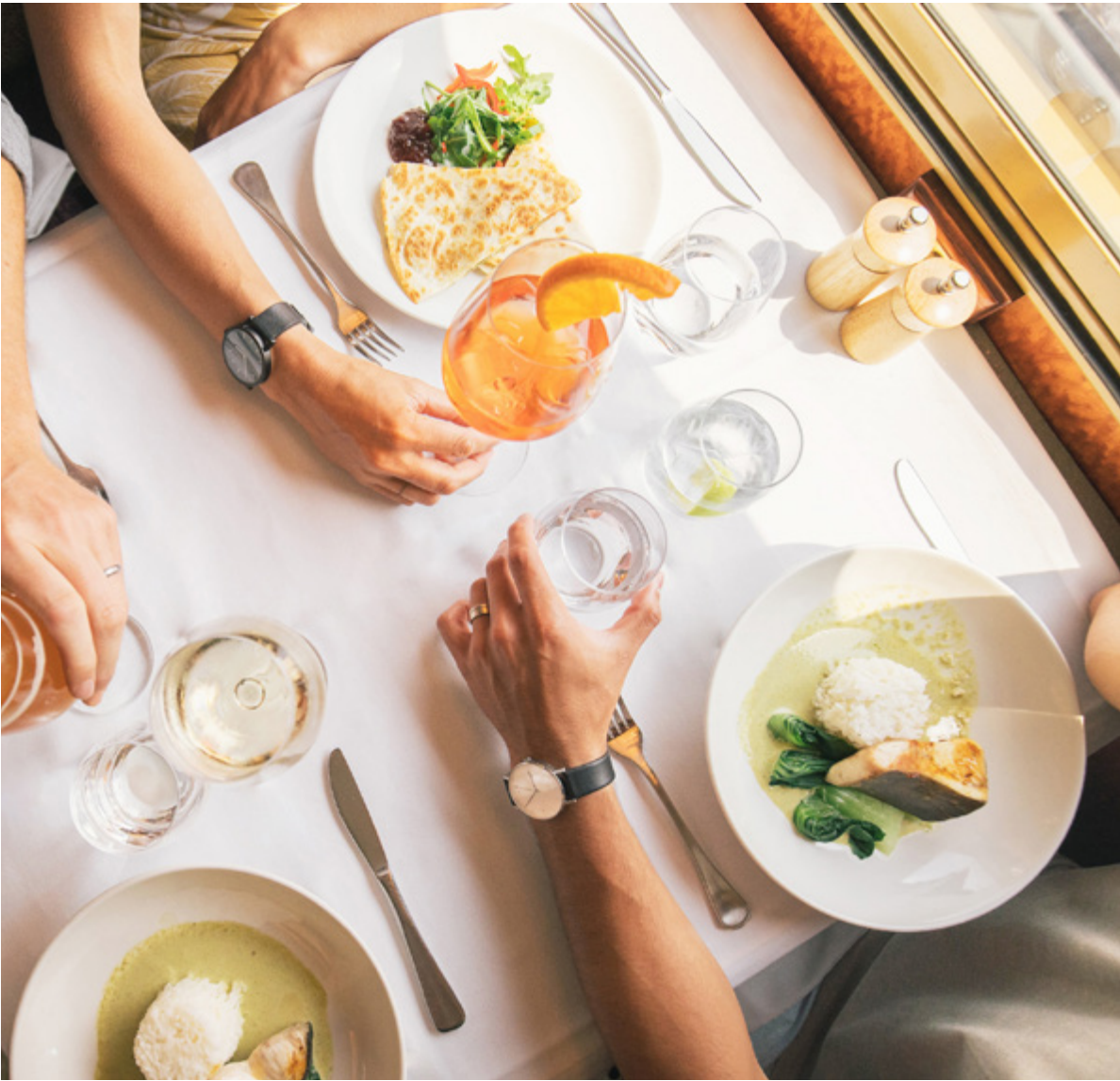
QUEEN ADELAIDE RESTAURANT