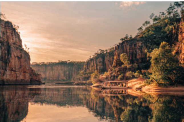
NITMILUK (KATHERINE GORGE), NT

OVERNIGHT: 2 nights DoubleTree by Hilton Esplanade Darwin