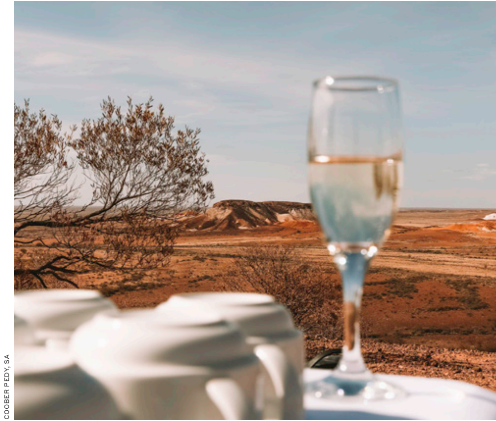
COOBER PEDY, SA