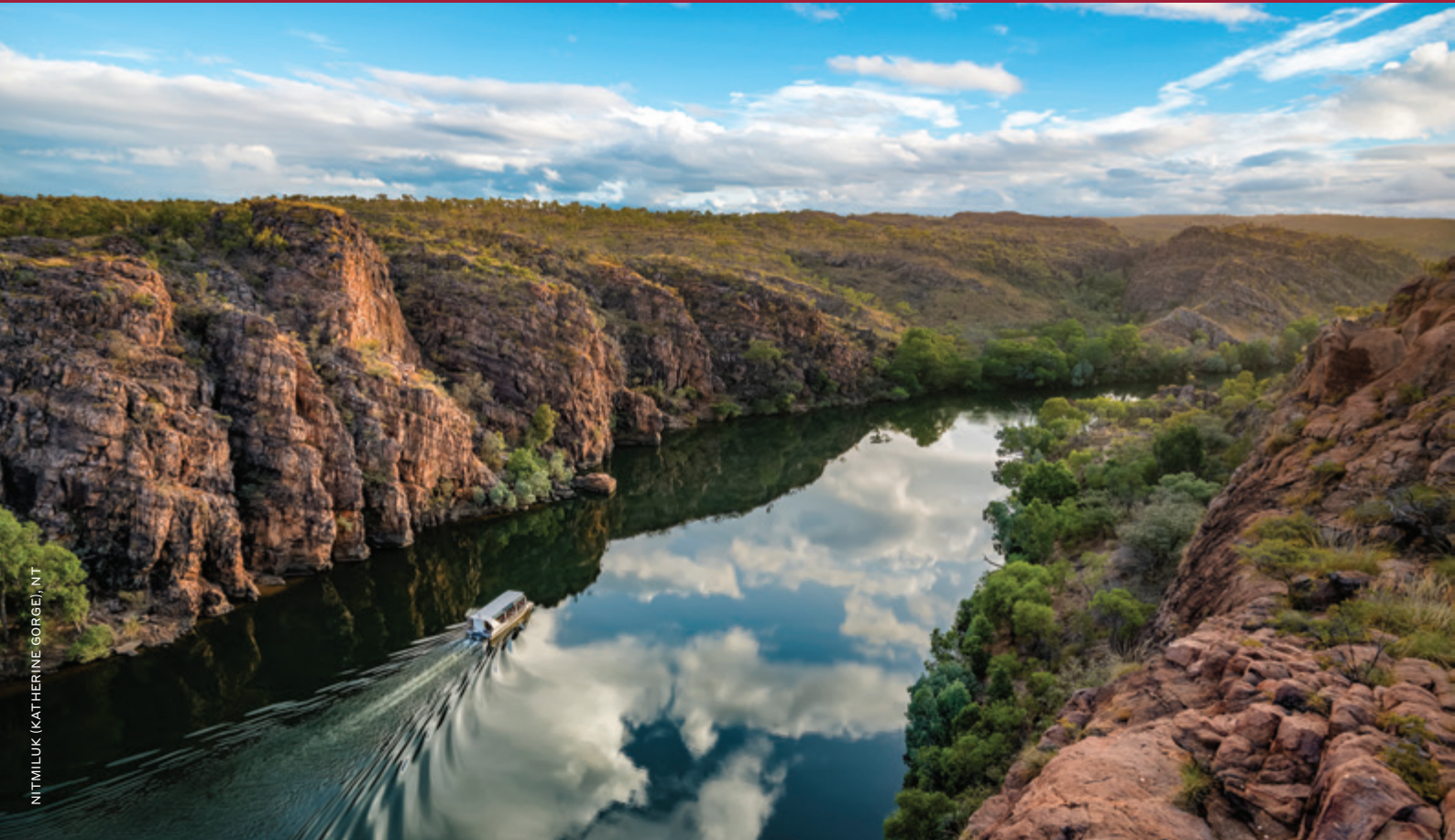
NITMILUK (KATHERINE GORGE), NT