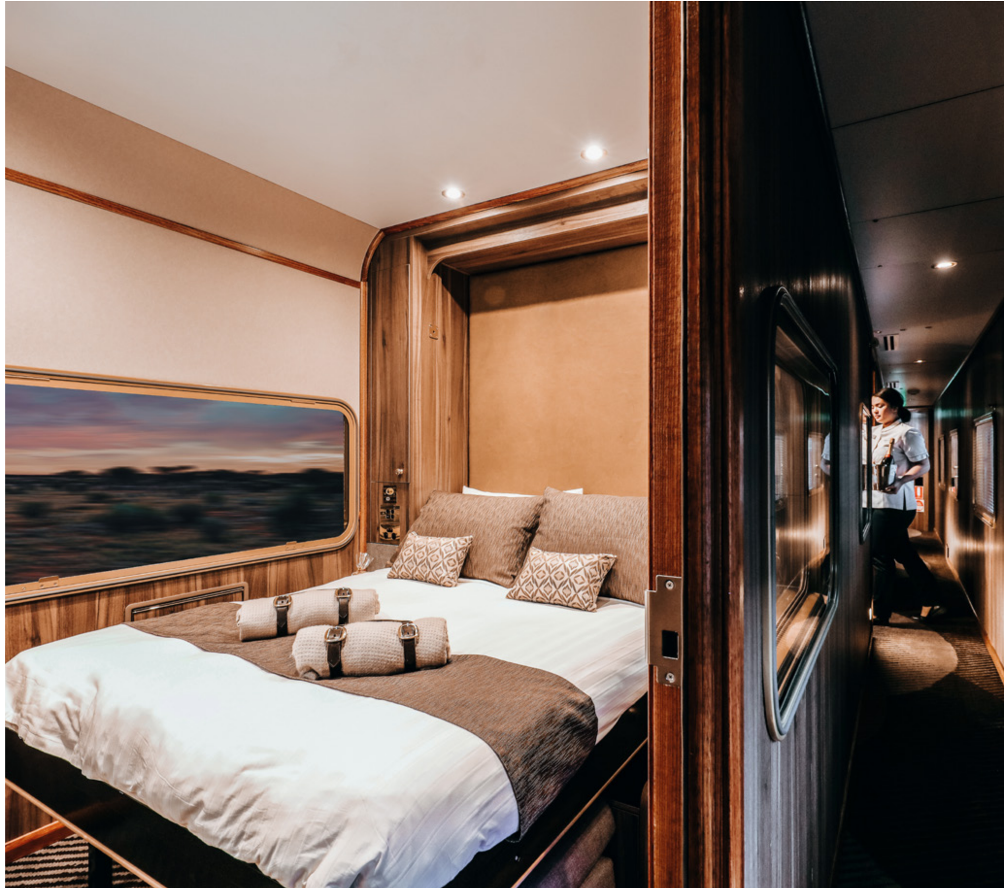
PLATINUM SERVICE DOUBLE CABIN BY NIGHT

And with a level of service that's hard to beat, your crew will ensure your journey is memorable from beginning to end. So, what are you waiting for? Delve into the world of premium rail journeys in the pages ahead.