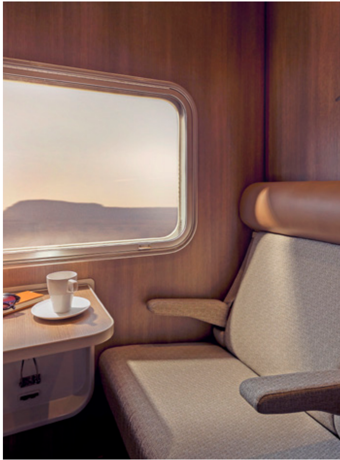
GOLD SERVICE SINGLE CABIN BY DAY