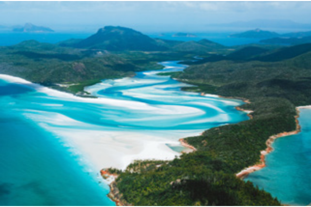
WHITEHAVEN BEACH AND HILL INLET, QLD