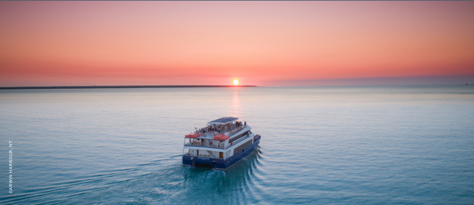
DARWIN HARBOUR, NT