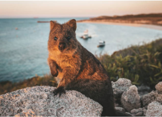
ROTTNEST ISLAND, WA

Make your way to Barrack Street Jetty and board the Rottnest Express ferry to unique, diverse Rottnest Island, located 22km offshore. A 90-minute air-conditioned coach tour around ‘Rotto’ takes you to some spectacular locations, including Wadjemup Lighthouse and the boardwalk lookout at the rugged West End. Enjoy a delicious lunch at Karma Rottnest Lodge before exploring the island at your leisure. Don't forget to take a quokka selfie before you depart! Return to Perth by ferry in the afternoon. (B,L)