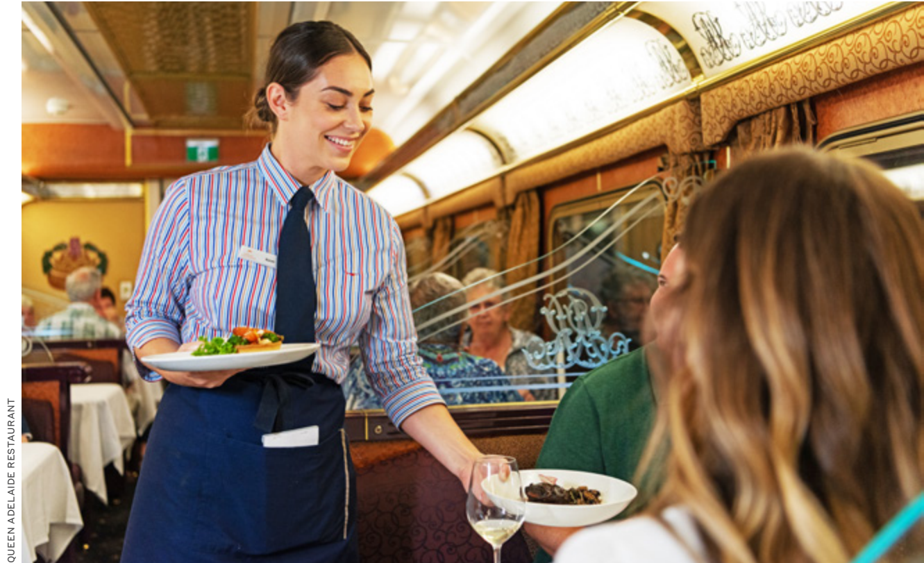
QUEEN ADELAIDE RESTAURANT