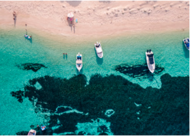
ROTTNEST ISLAND, WA

It might be the largest state in Australia, but Western Australia's capital city is wonderfully compact packed with things to see and do. Enjoy your day at leisure in Perth by visiting Kings Park, Barrack Square or the many museums and galleries. (B)