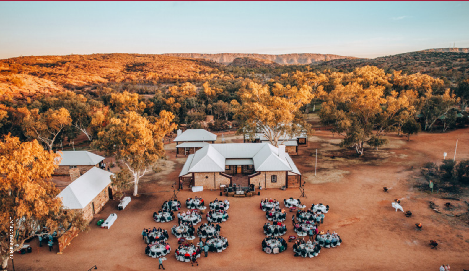
ALICE SPRINGS, NT