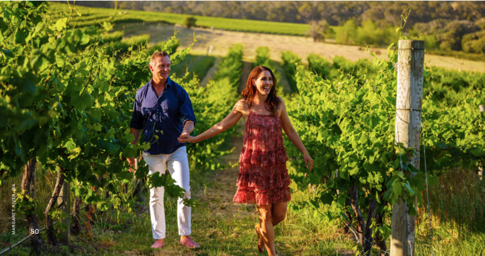
MARGARET RIVER, WA

Journey Beyond Cruise Sydney from $119 per person Step on board and begin your Sydney Harbour adventure. Departing from Darling Harbour and cruising past icons such as the Harbour Bridge and Sydney Opera House, it's the perfect way to experience Sydney like a local. All-inclusive lunch and dinner cruise options are available, featuring regionally sourced produce and wines. Learn more at journeybeyondrail.com.au