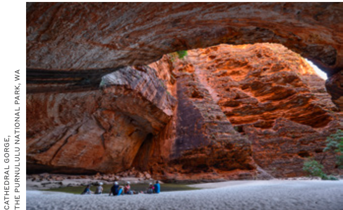
CATHEDRAL GORGE, THE PURNULULU NATIONAL PARK, WA