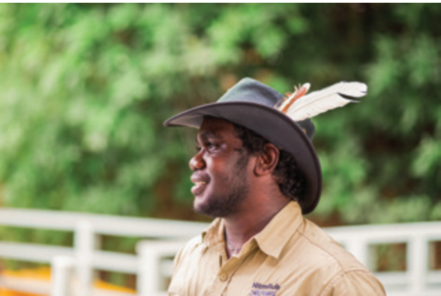
NITMILUK (KATHERINE), NT