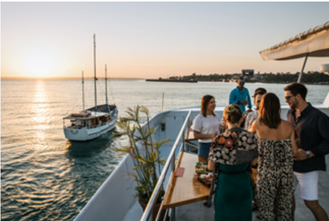
DARWIN HARBOUR, DARWIN, NT