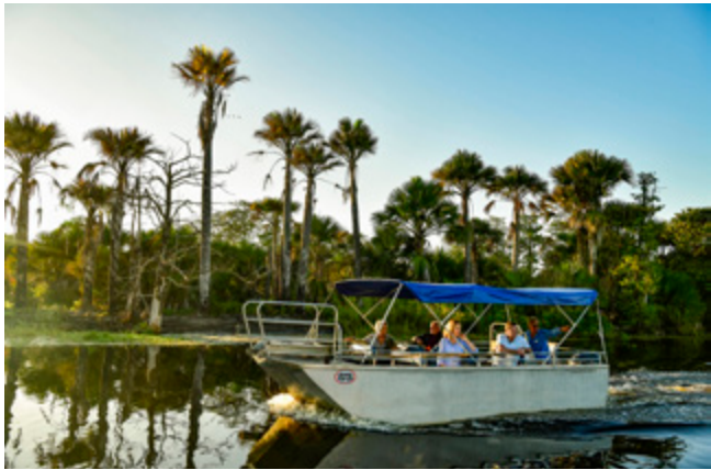
ARAFURA SWAMP CRUISE, ARNHEM LAND, NT