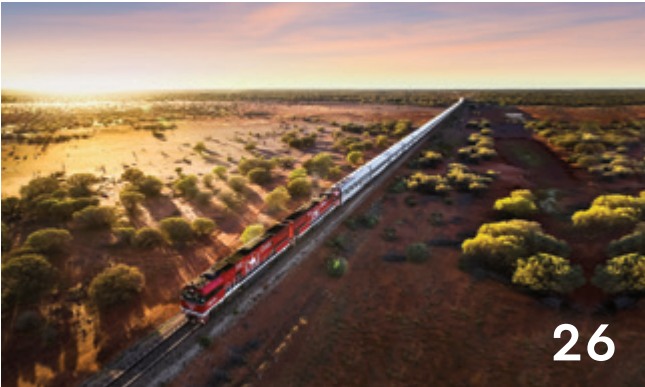
The Ghan Journeys