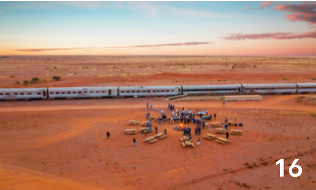
The Ghan Expedition Journeys

THE GHAN INDIAN PACIFIC GREAT SOUTHERN THE OVERLAND